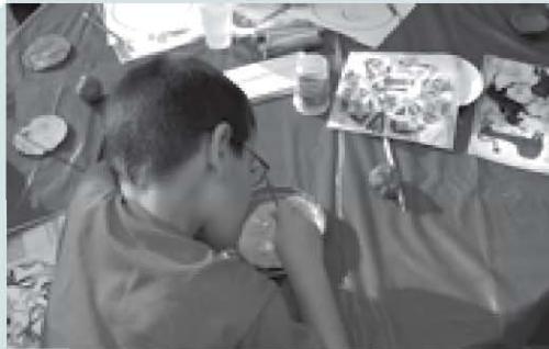
A student from our September family workshop on PA German pottery carefully decorates his sgraffito plate with slip. Due to high attendance in our fall workshop series, we doubled our winter offerings to twice a month!