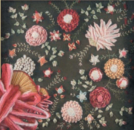
Regina Anders created this wool picture using popular Victorian colors.

These were commonly seen phrases embroidered on bookmarks and pictures during the Victorian period.